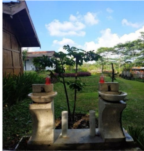
Figure 1. Bhumi Merapi agrotourism