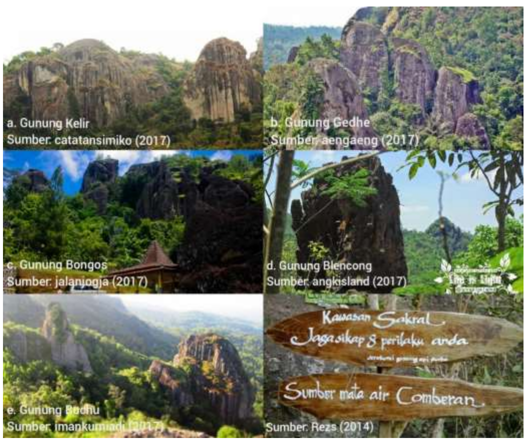
Figure 1. Gunung Api Purba Atraction