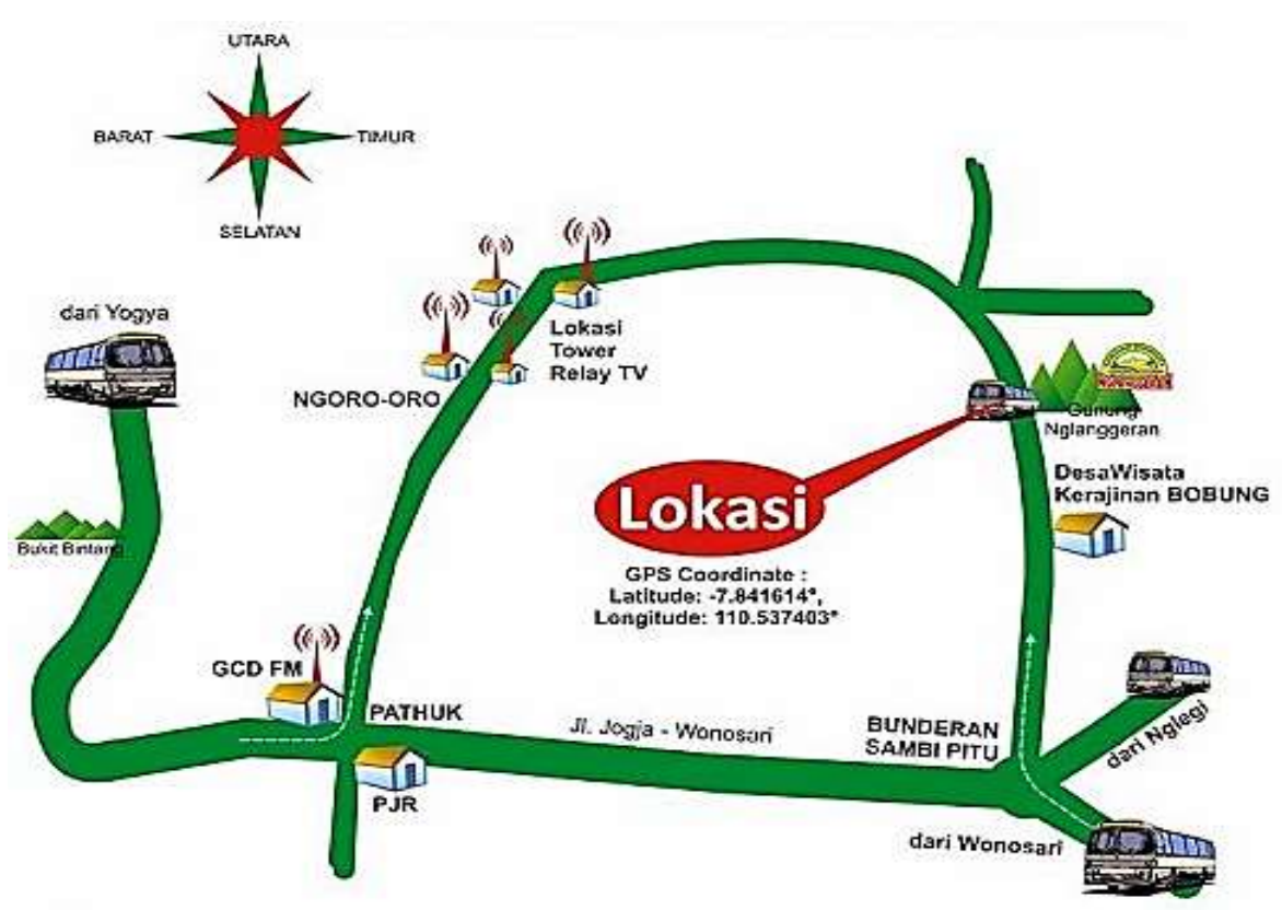
Figure 2. Location plan to the Nglanggeran Ancient Volcano

The beautiful natural scenery spoils the eyes of mountain climbers—a wide-spread rural atmosphere with terraced rice fields around. Adventure-loving tourists can try climbing the boulders because this location is perfect for rock climbing, trekking, cruising and camping.